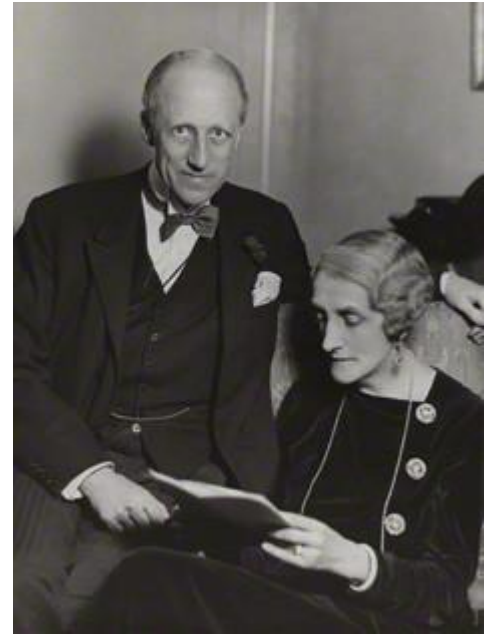
Sir Evelyn Wrench and Lady Hylda Wrench